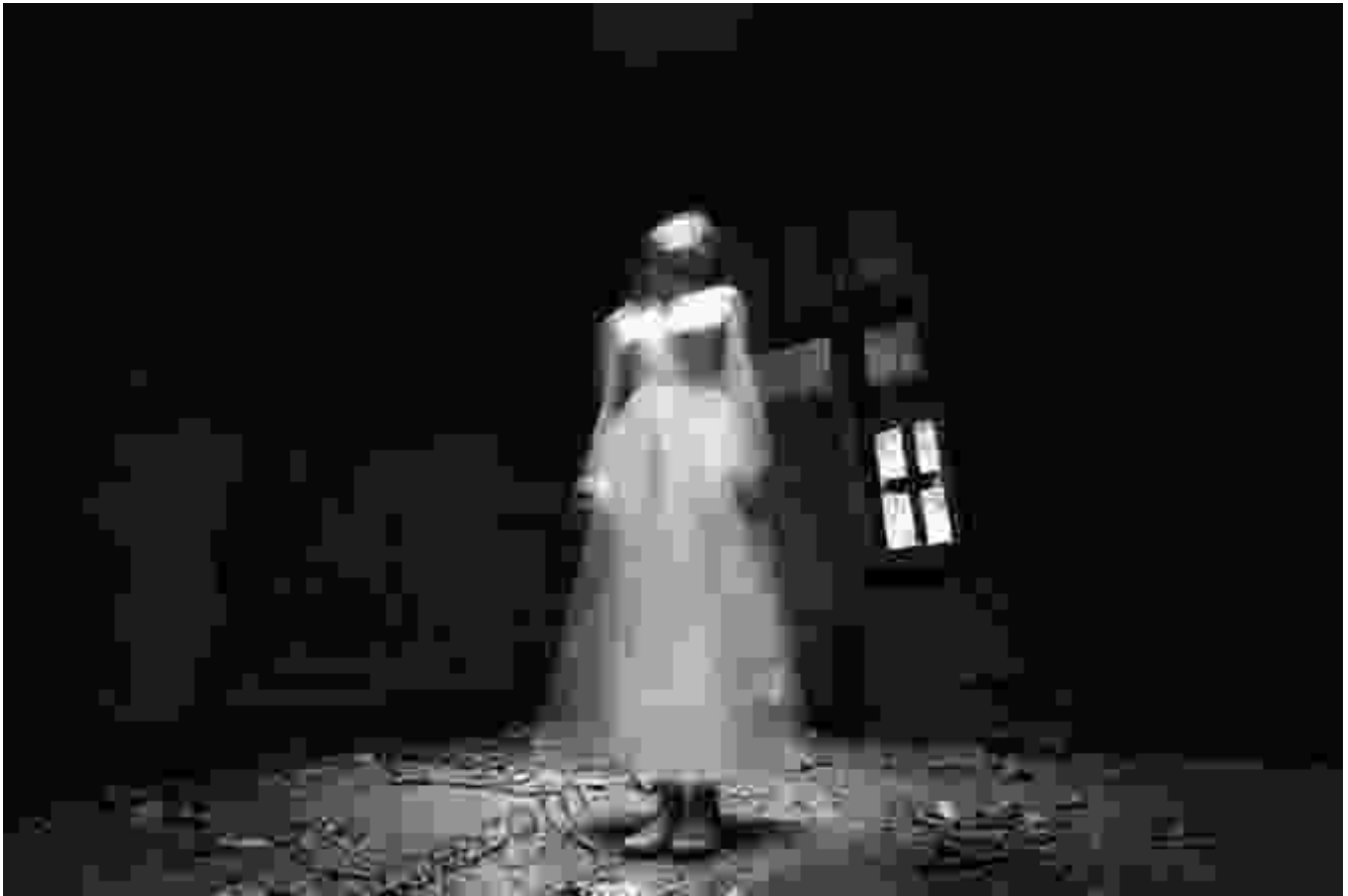
The Phantom Hitchhiker of Amarillo

On the lonely stretch of Route 66 near Amarillo, Texas, a chilling tale of a phantom hitchhiker unfolds. Motorists driving along the highway have reported picking up a young woman in a white dress, who asks to be taken to a nearby cemetery. However, when they arrive at the cemetery, the woman mysteriously vanishes. Some believe she is the ghost of a young woman who was killed in a car accident on the same road, while others claim she is a vengeful spirit seeking retribution for her untimely demise.