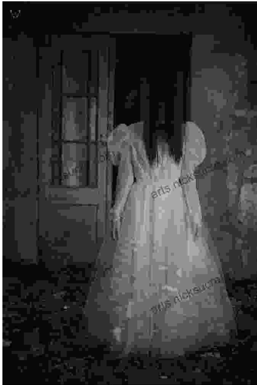
The Screaming Skull of La Recoleta